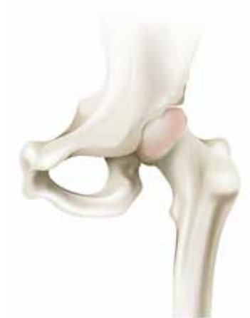
top: hip joint with cartilage degeneration (osteoarthritis)